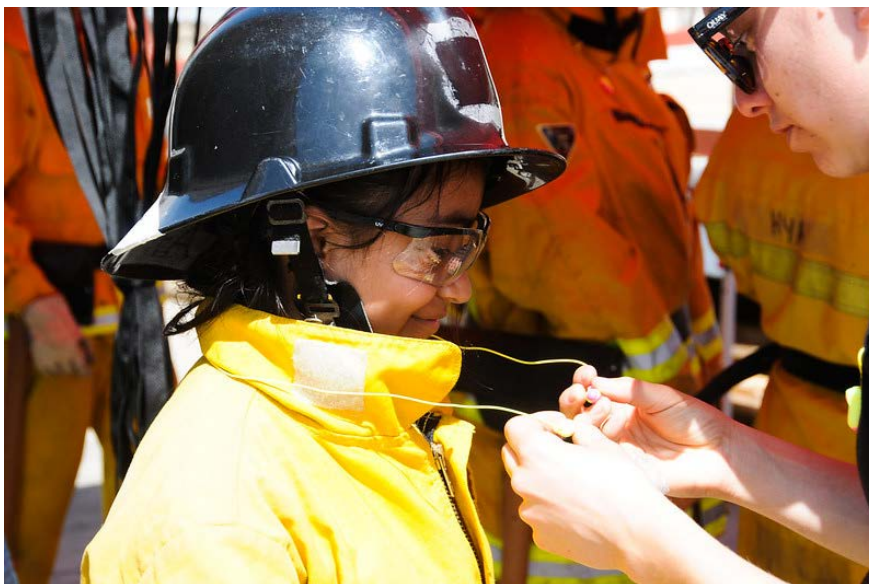
LAFD Volunteer Photographer Program

Firefighters from underrepresented communities who are not in the role of community liaison may informally be recruiting through word of mouth. Employee resource groups or affinity groups may also be a natural source of recruitment. However, there should not be an expectation that employees or groups recruit for the department for free and they should not be constantly asked to represent the department at public events. If individuals are doing recruitment for the department, they should be compensated for their time. Tacoma Fire Department has a diverse team of around 50 employees who get paid overtime to do recruitment and Atlanta Fire Rescue created a LGBTQ liaison role in their department.